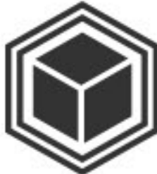
Aluminum Alloy A6061-T6