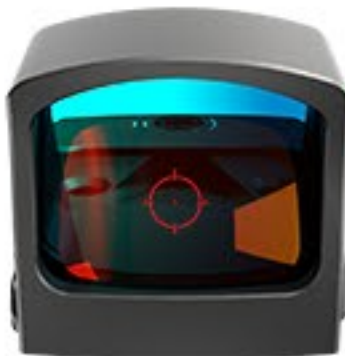
Motion Sensor For Automatic Activation