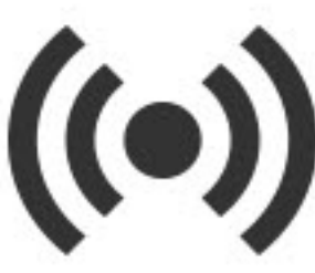
MotionWake Technology Motion Sensing Activation