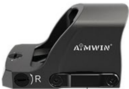
Side Loading Battery