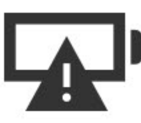
Low Power Indication